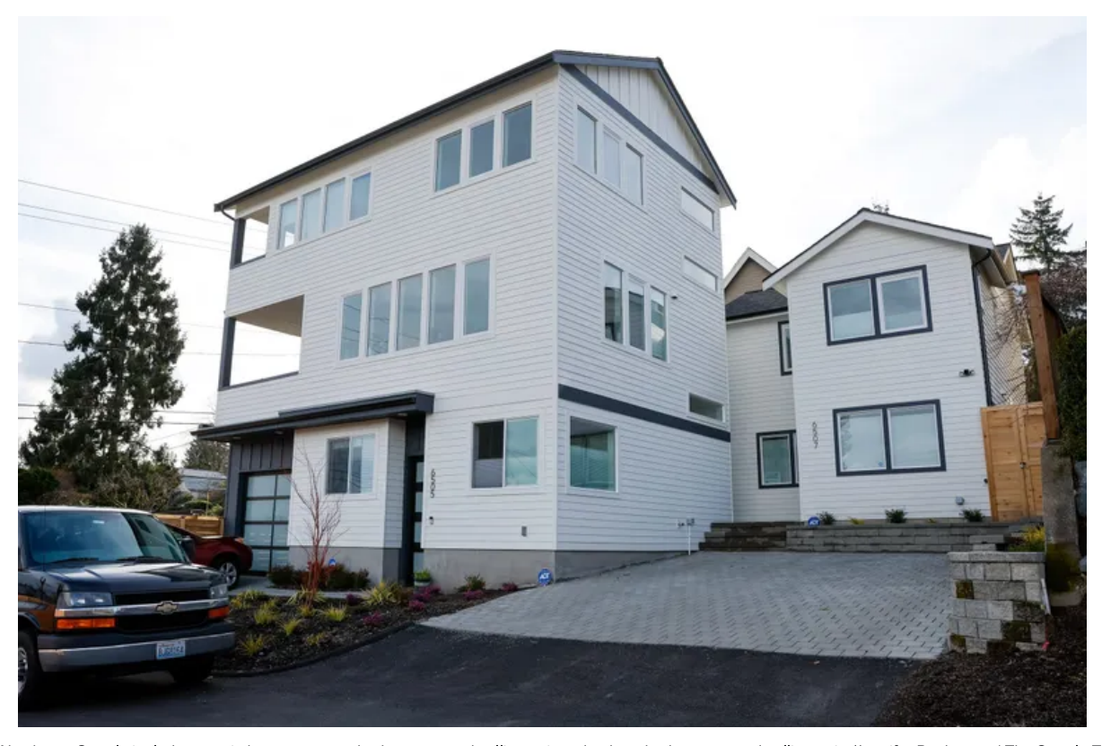
This three-home new development in Northeast Seattle includes a main house, an attached accessory dwelling unit and a detached accessory dwelling unit.

Meanwhile, a growing number of ADUs are being permitted as condominiums and sold separately. They're not necessarily cheap, with a median unit selling for $732,000 in a limited sample analyzed for the city's report. But because they're smaller, they're less expensive than the single houses on the same properties, with a median house selling for $1.2 million in the city's sample.