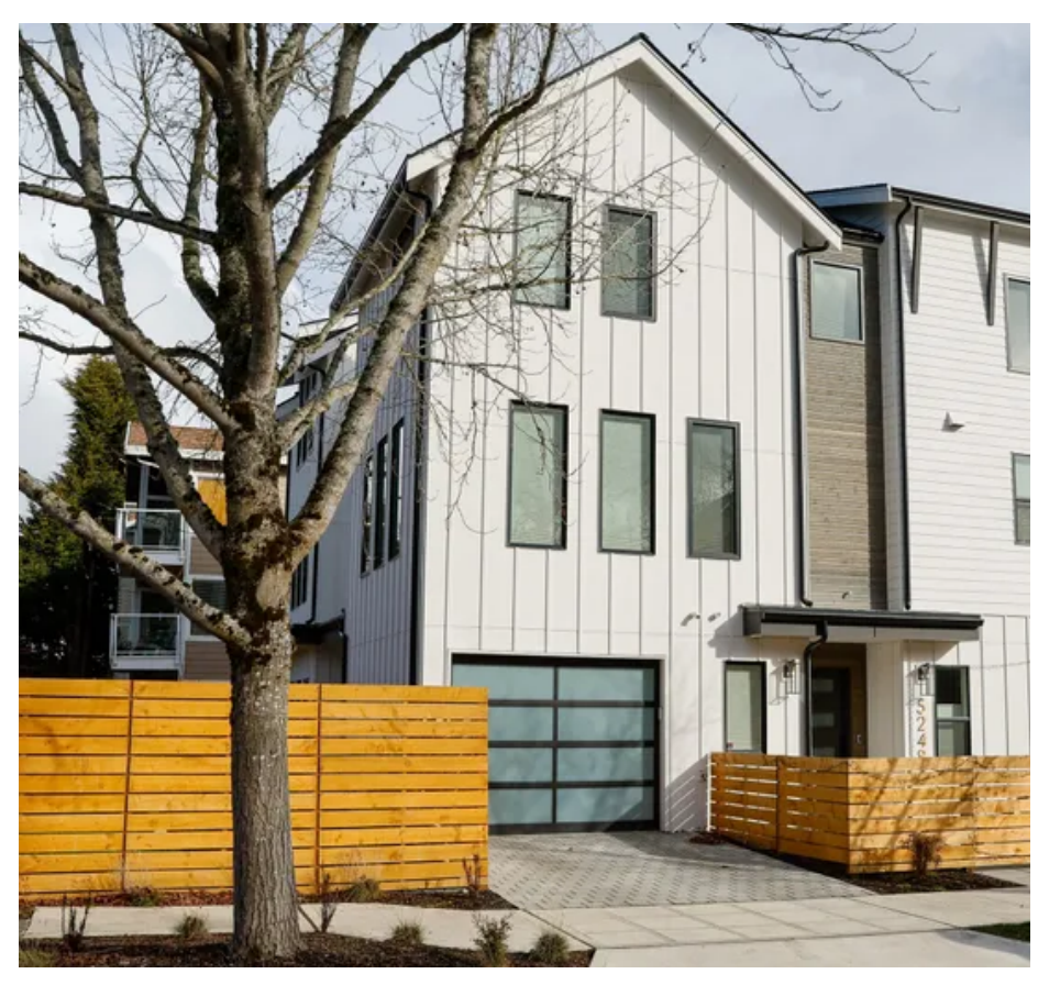
■ 8 of 8 | This three-home new development in Northeast Seattle includes a main house, an attached accessory dwelling unit and a detached accessory dwelling unit. Less ∧

March 8, 2023 at 6:00 am | Updated March 8, 2023 at 9:16 am