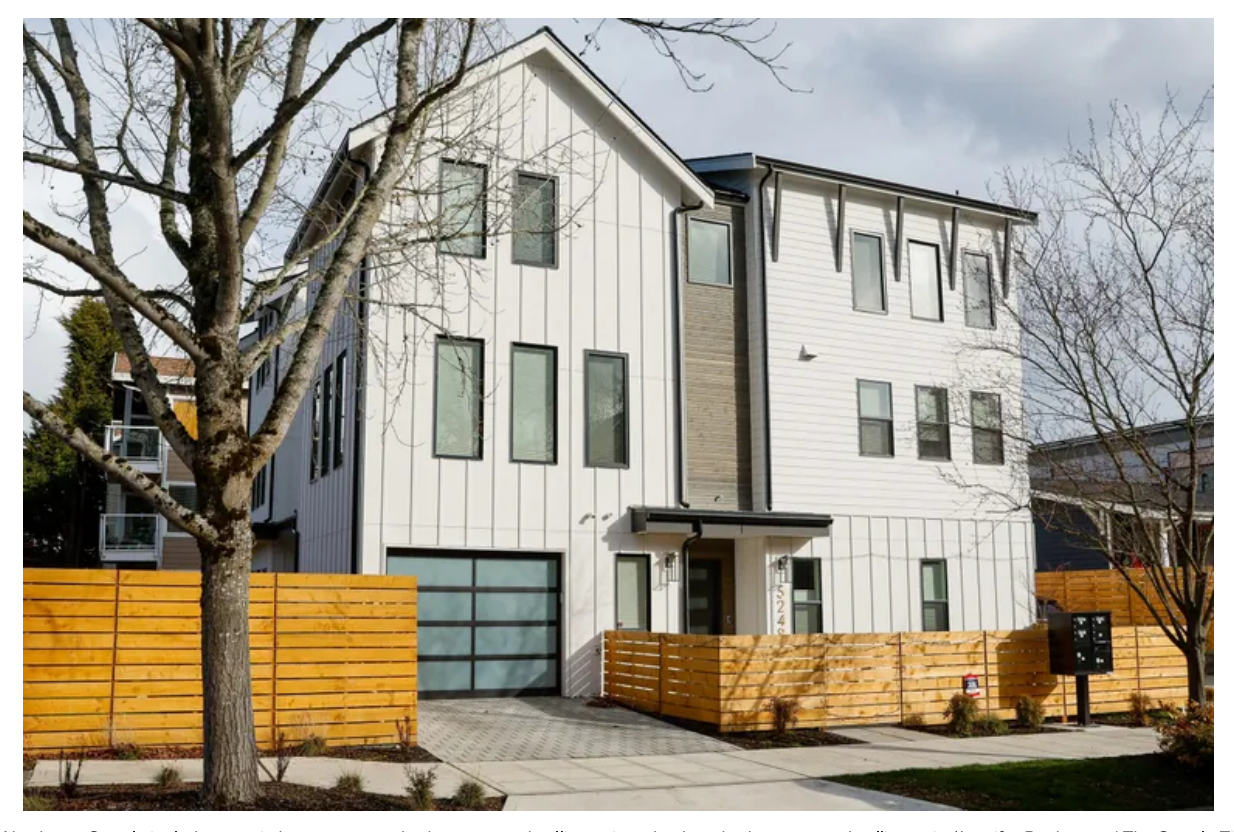
This three-home new development in Northeast Seattle includes a main house, an attached accessory dwelling unit and a detached accessory dwelling unit.